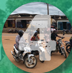
CHURCH PLANTER TRANSPORTATION